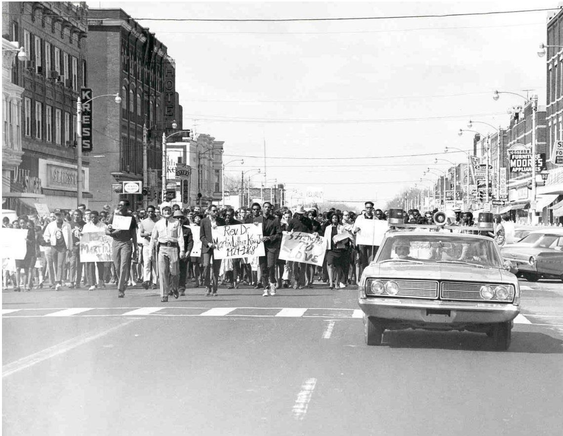
Pittsburg Police assist with a 1968 memorial march in downtown Pittsburg after the death of Dr. Martin Luther King.